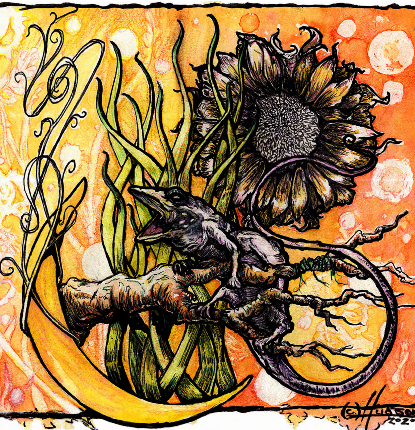
Detail of "I Am the Lizard King" by Chip Hudson | Profile, Page 4