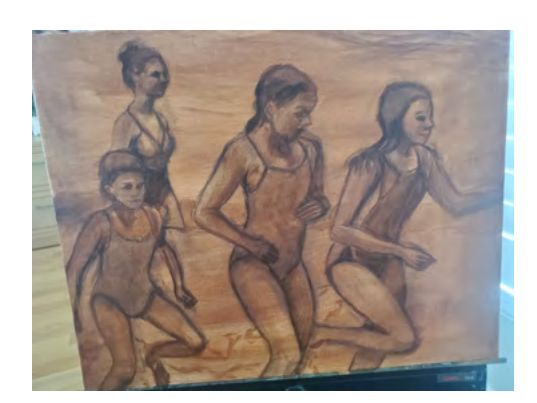
First, I toned my canvas with a mixture of Burnt Sienna and Metallic Copper. I wanted a glow on the canvas as a starting point. Next, I began sketching the image on the canvas with Burnt Umber. I wanted to be able to keep some of the sketch lines all the way through the painting. The next day, I corrected any sketch errors and laid in more values.