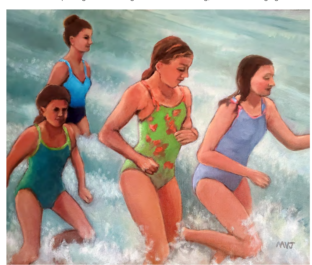
I finished the painting on the sixth day. I sprayed a thin layer of Winsor & Newton Retouching Varnish at that time and signed the painting.

I love to paint people in casual settings. I've been taking free portrait classes offered through the Smithsonian National Portrait Gallery. The hour-long classes focus on a specific topic, such as how to paint noses or ears. I highly recommend taking advantage of classes and videos you can find online. They are terrific! Now, on to the next painting!