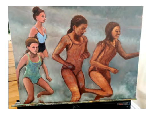
3 began to lay in color on the figures. Over two additional days, I laid in more color, sharpened values, shortened an arm that I made too long, and added the highlights.