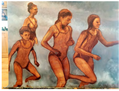
Next, I refined the sketch, added more values, and began laying in the background. The background would shift three more times in the painting as I went along.