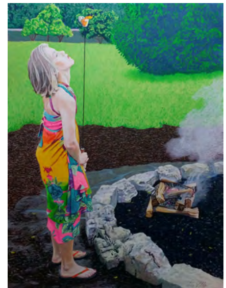
"LET IT BURN"

an artist who has had success – to help advise you along the way.