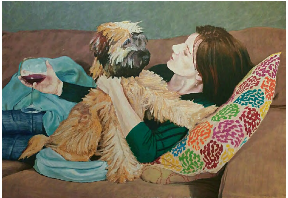
"THE PERFECT TRIO"

Make it a hobby. If you can't do that, then learn applicable trades; study the capabilities and limitations of mediums; network and collaborate with other artists; find a mentor –