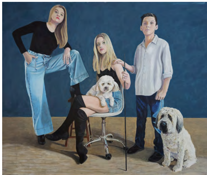
"THE WILLE KIDS"