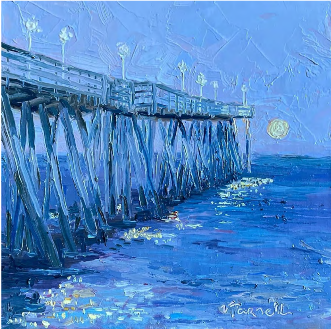
This 6x6" painting of the Steel Pier in Virginia Beach by Val Parnell is shown actual size.